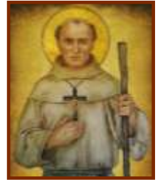
Saint Junípero Serra