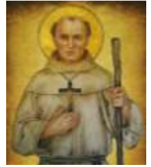
Saint Junipero Serra Founder, 1769